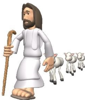
JESUS THE GOOD SHEPHERD

Come and join with the parish in prayer for special blessings that each person will be strengthened in their vocation.