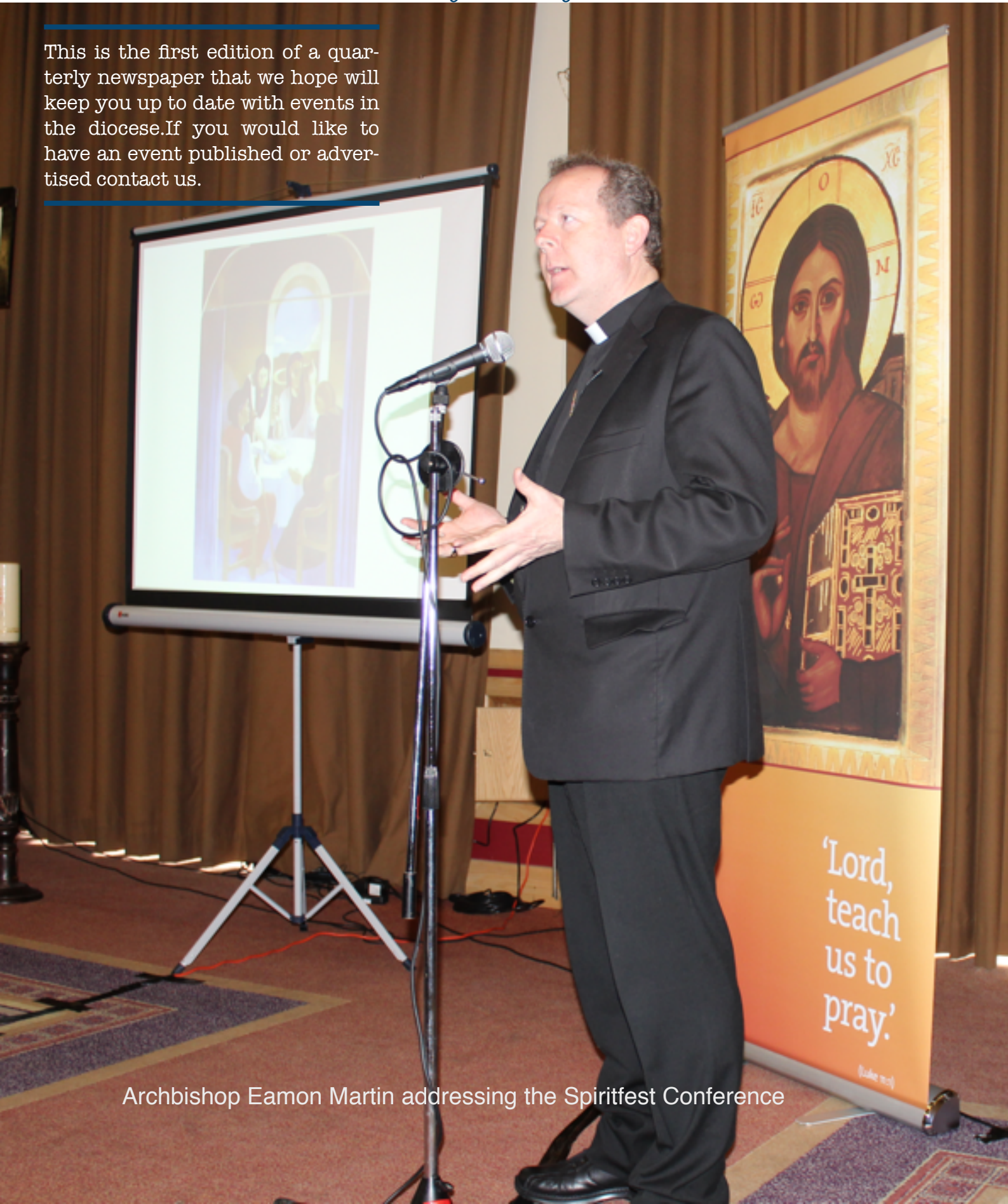
Archbishop Eamon Martin addressing the Spiritfest Conference

This is the first edition of a quarterly newspaper that we hope will keep you up to date with events in the diocese. If you would like to have an event published or advertised contact us.